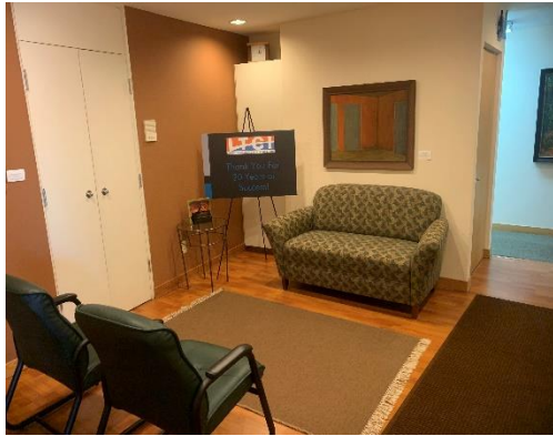
Suite Interior Photos