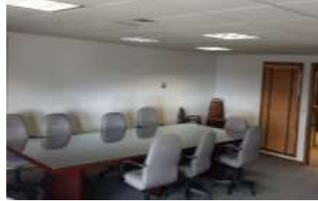
Area Conf. Room & Lobby