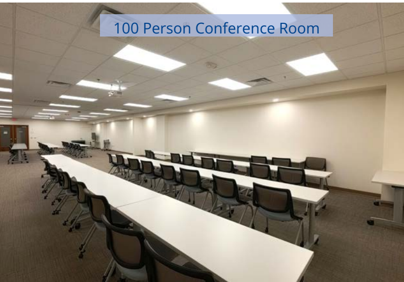
100 Person Conference Room