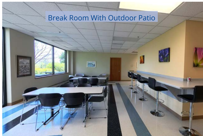
Break Room With Outdoor Patio