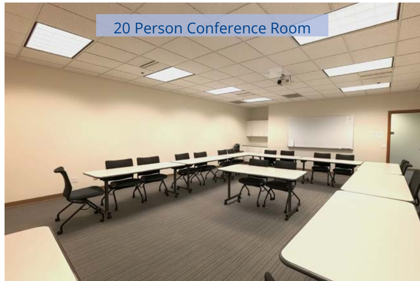
20 Person Conference Room