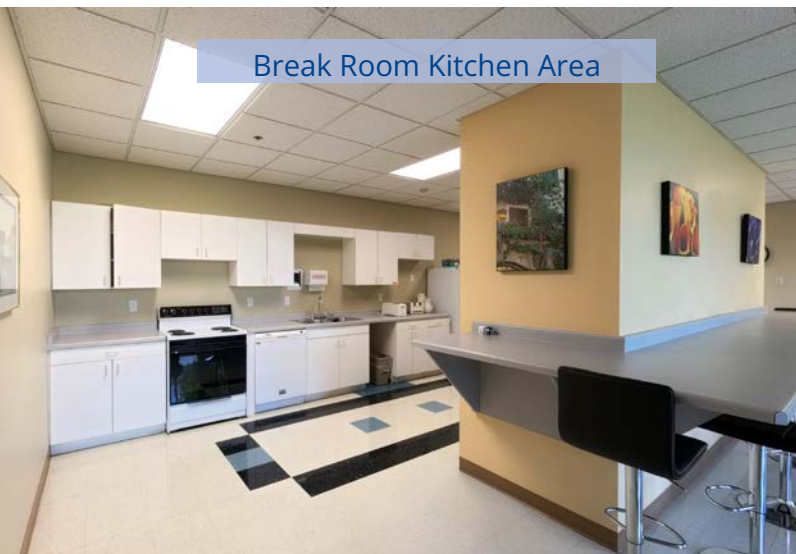
Break Room Kitchen Area