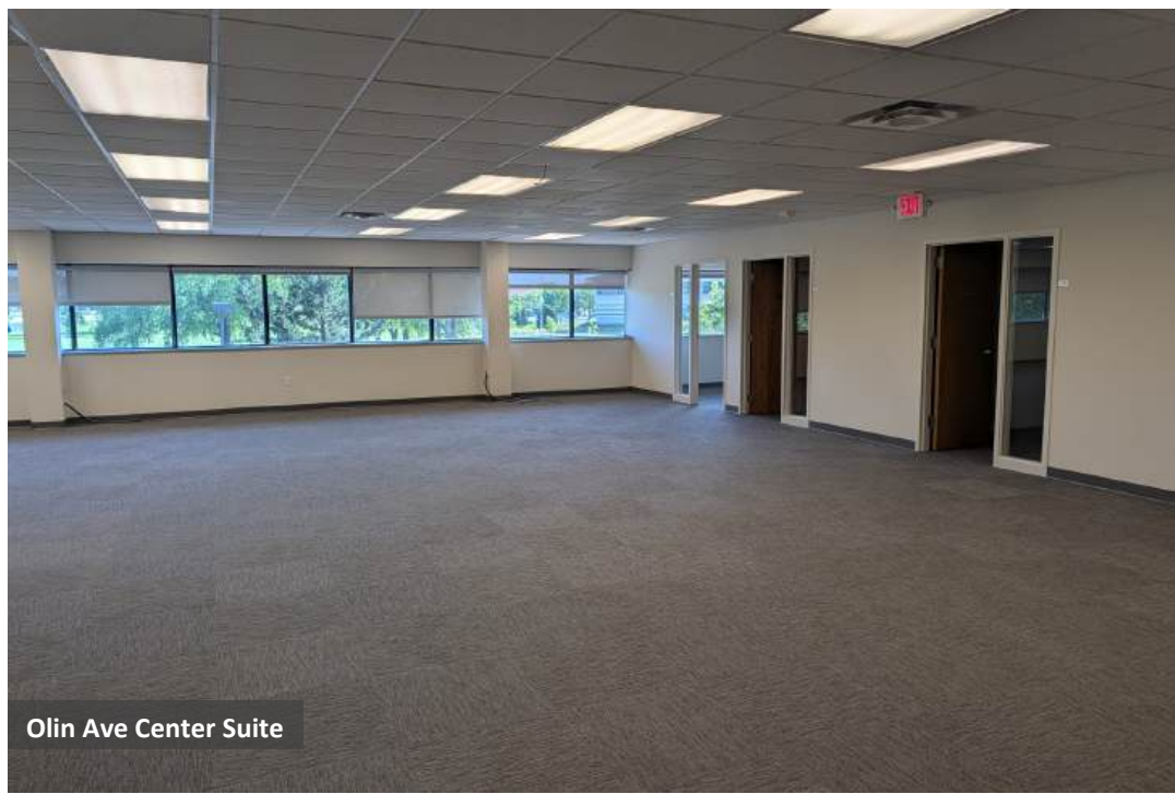
Olin Ave Center Suite