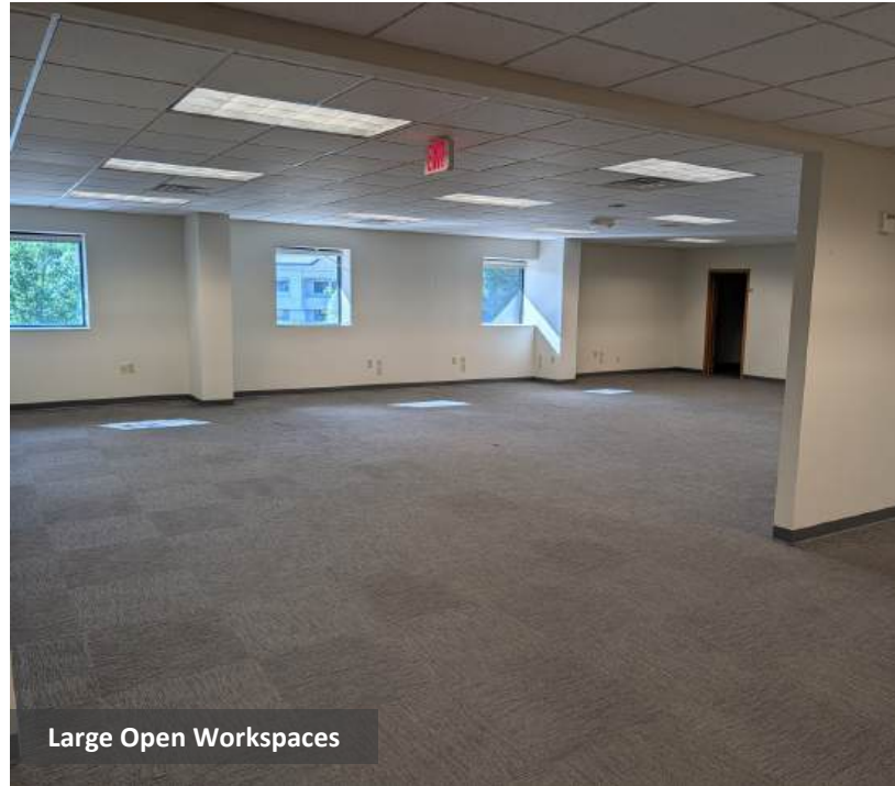
Large Open Workspaces