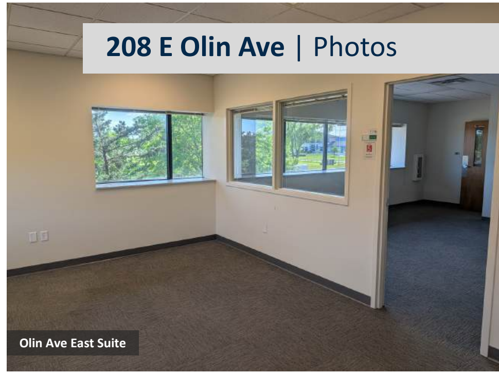
Olin Ave East Suite