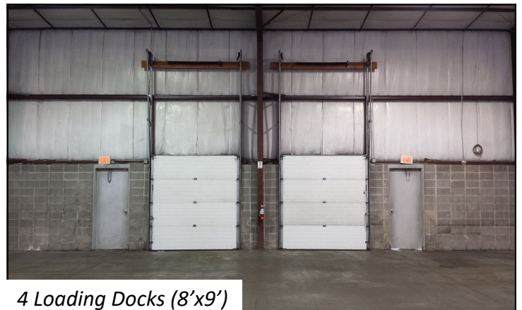
4 Loading Docks (8'x9')