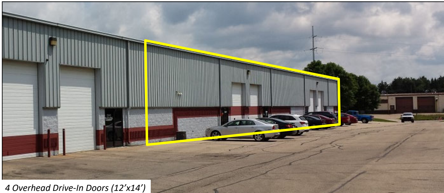
4 Overhead Drive-In Doors (12'x14')