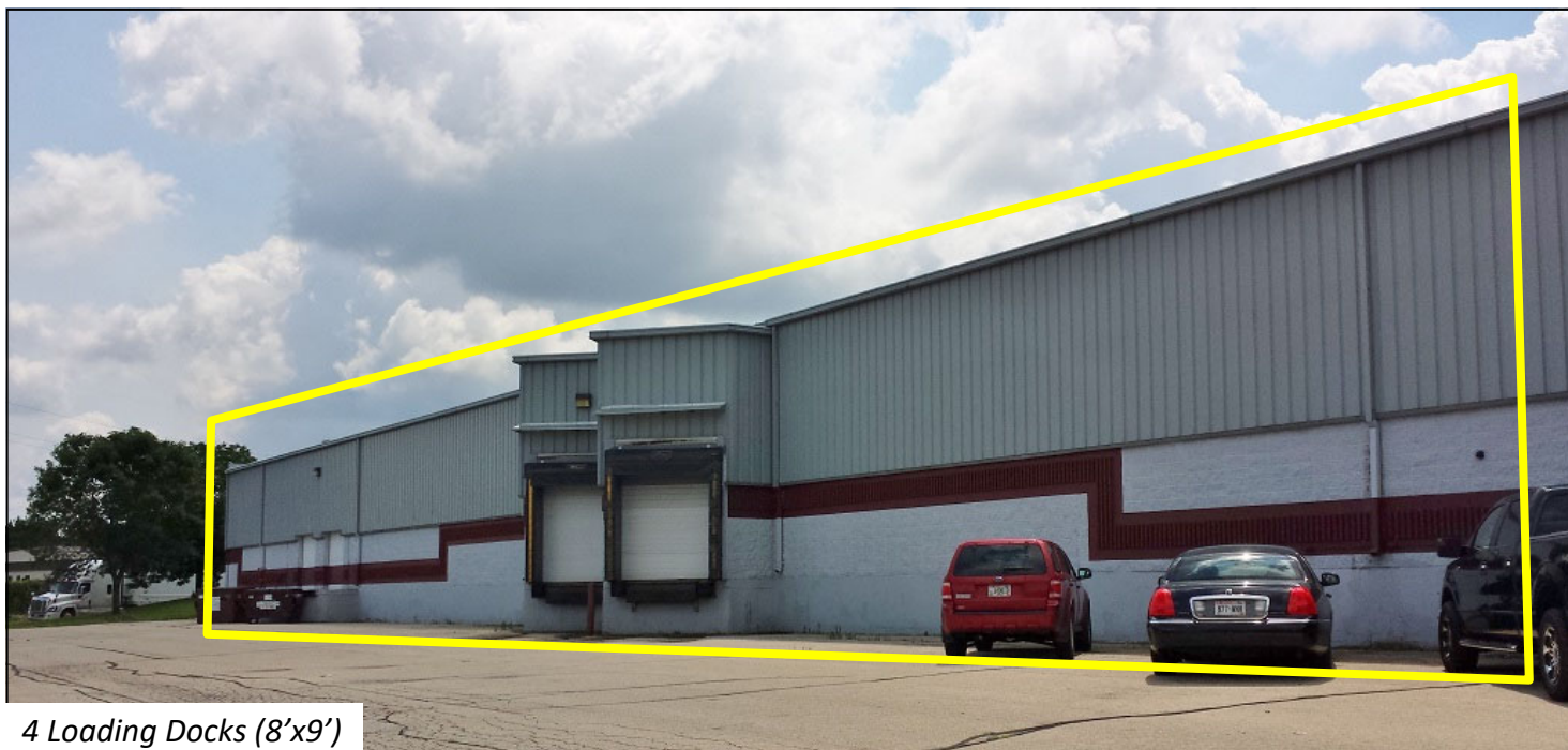
4 Loading Docks (8'x9')