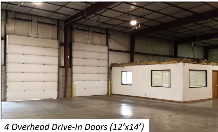
4 Overhead Drive-In Doors (12'x14')