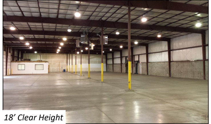
18' Clear Height