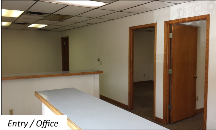
Entry / Office