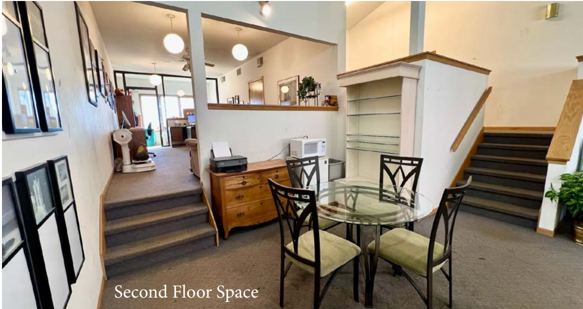
Second Floor Space