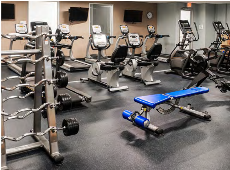
OFF-SITE FITNESS CENTERS