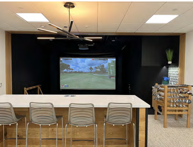
OFF-SITE GOLF LOUNGE