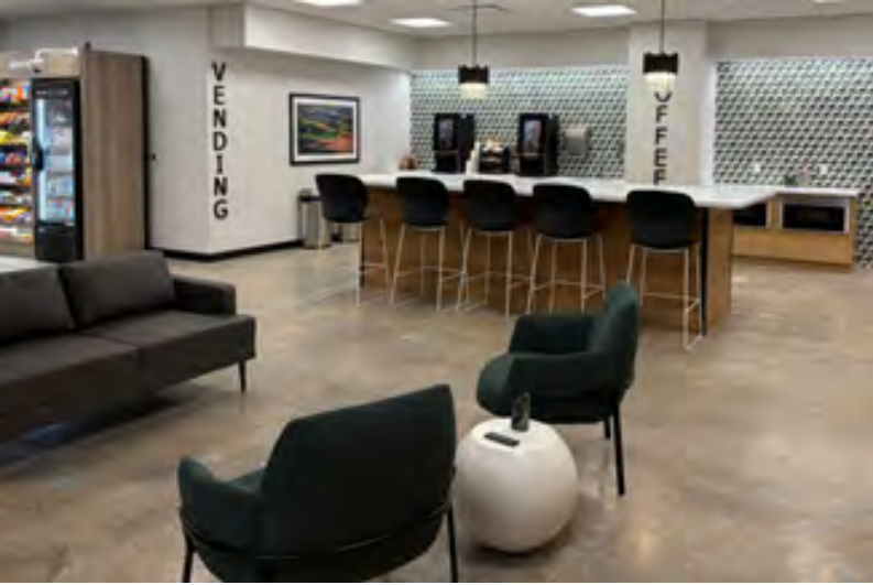
OFF-SITE SELF-SERVE COFFEE LOUNGE