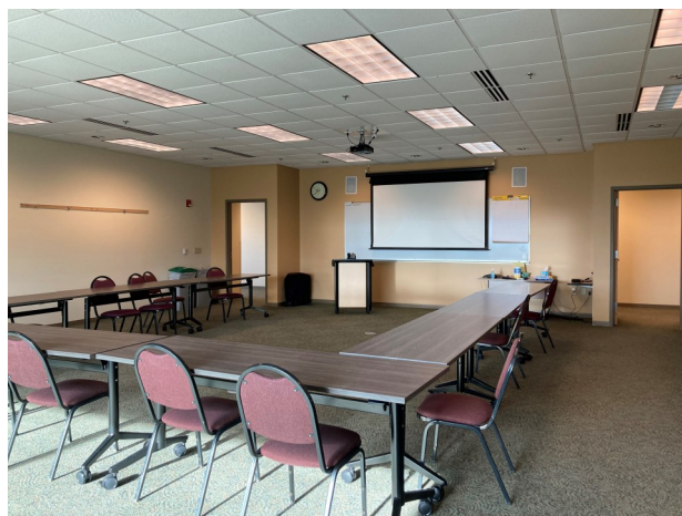
One of Many Conference Rooms