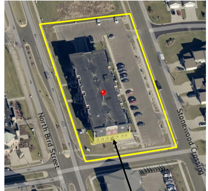
1st Floor Commercial Suite