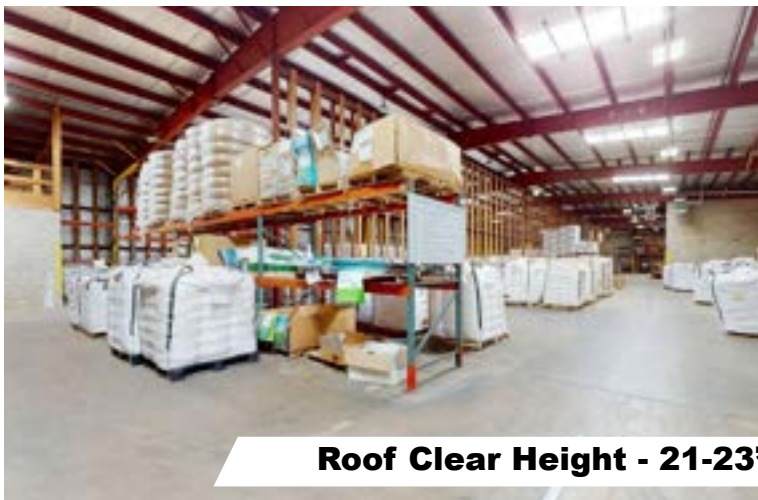
Roof Clear Height - 21-23'