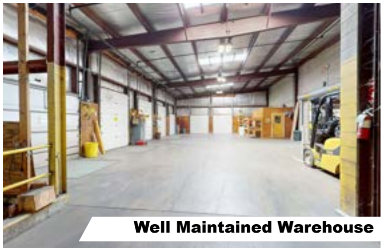
Well Maintained Warehouse