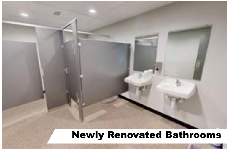
Newly Renovated Bathrooms