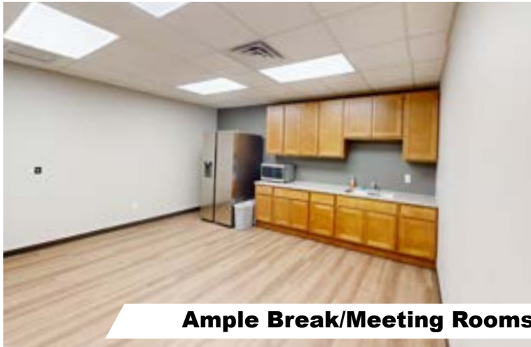
Ample Break/Meeting Rooms