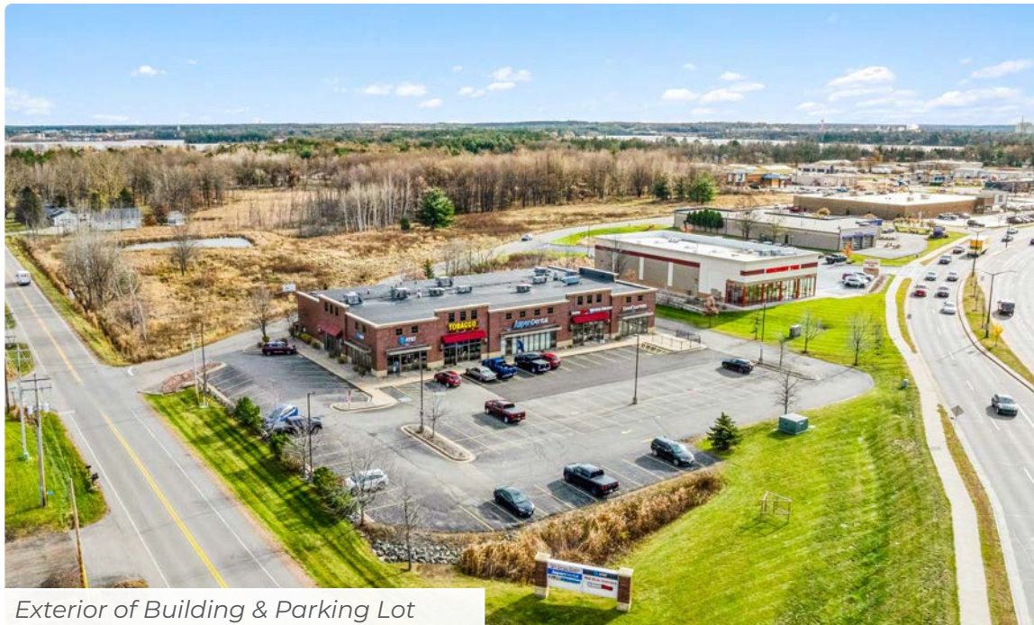
Exterior of Building & Parking Lot