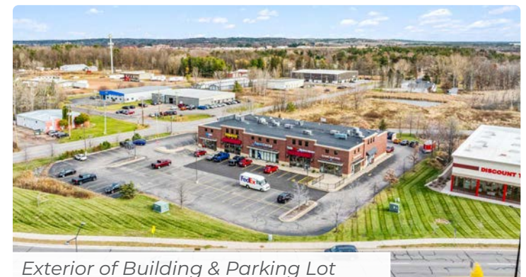
Exterior of Building & Parking Lot