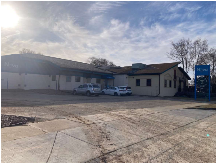
Frontage of Nova