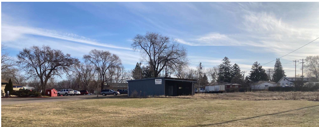
Metal Building on 1609 N Stoughton Rd