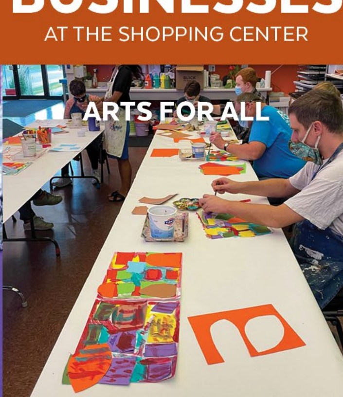
ARTS FOR ALL