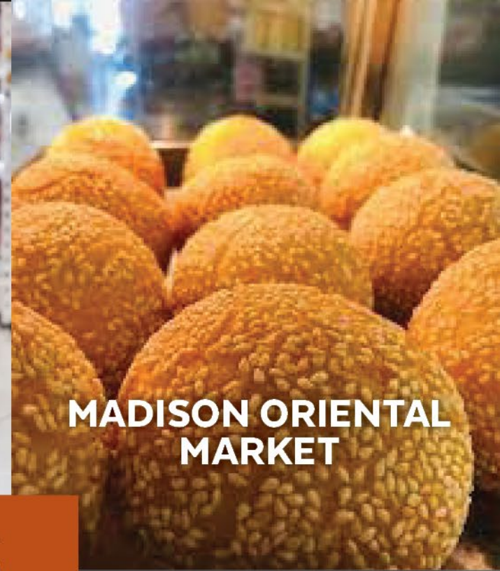
MADISON ORIENTAL MARKET