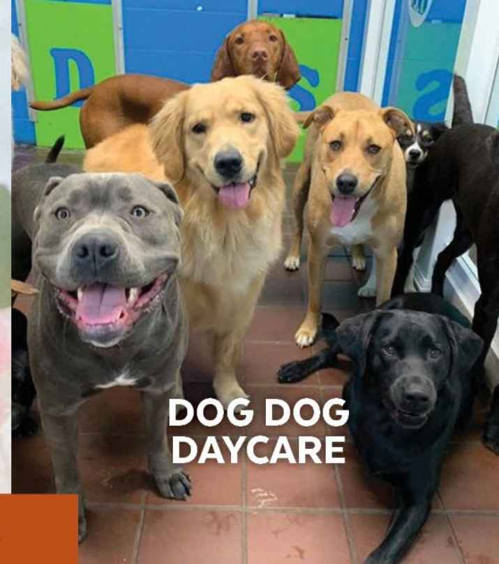
DOG DOG DAYCARE