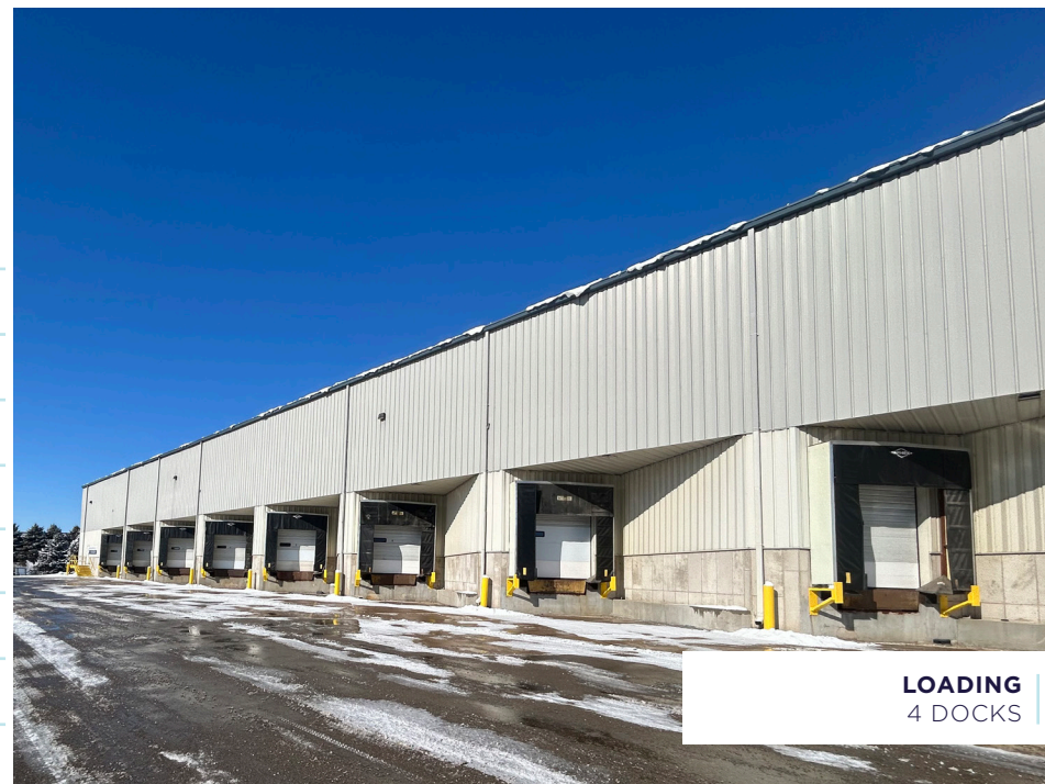
LOADING 4 DOCKS