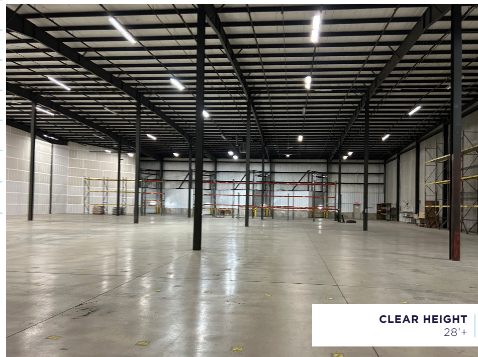
CLEAR HEIGHT 28'+