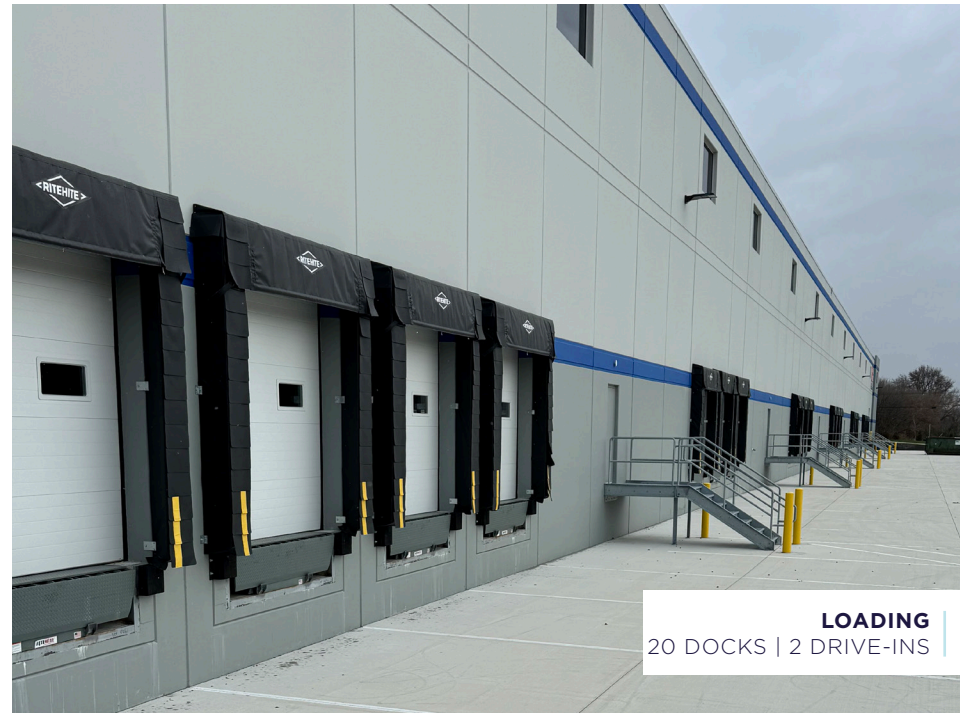
LOADING 20 DOCKS | 2 DRIVE-INS