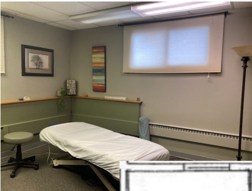
1st Floor Suite Picture: