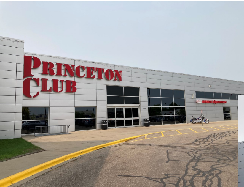
1726 Eagan Road (Interior Suite)