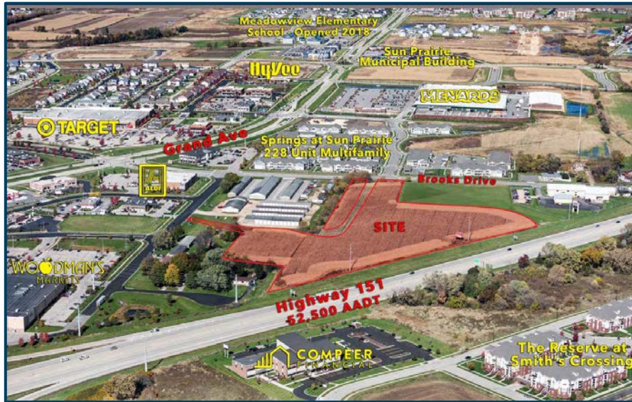
■ AERIAL LOOKING NORTH