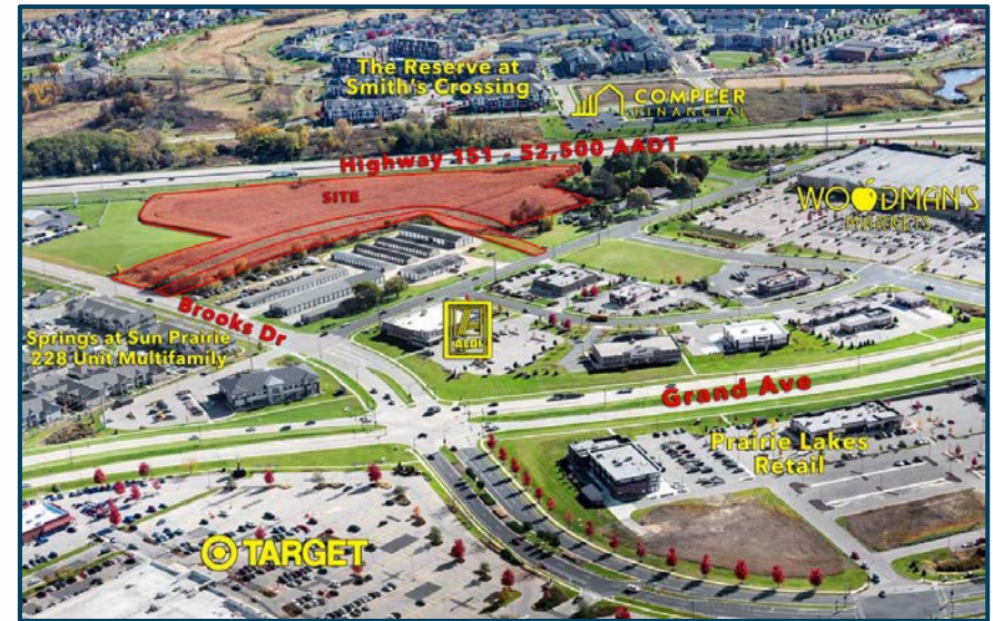
■ AERIAL LOOKING EAST