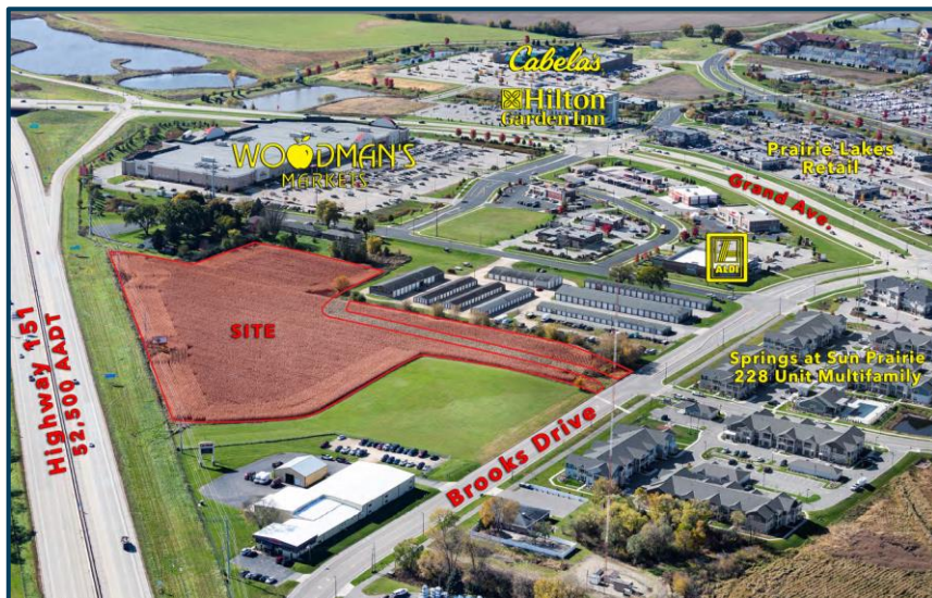
■ AERIAL LOOKING SOUTH