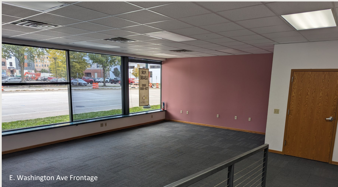
E. Washington Ave Frontage