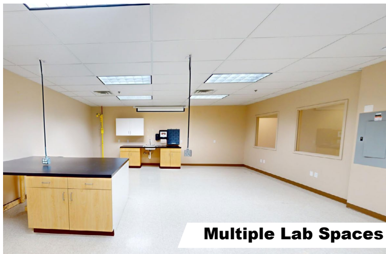
Multiple Lab Spaces