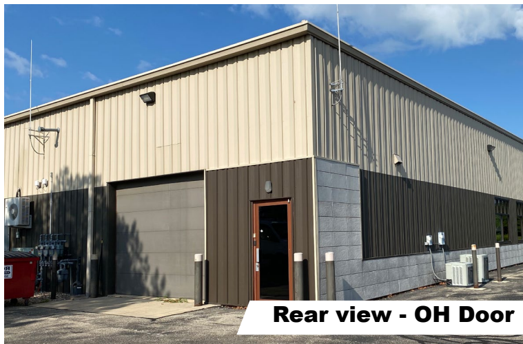
Rear view - OH Door