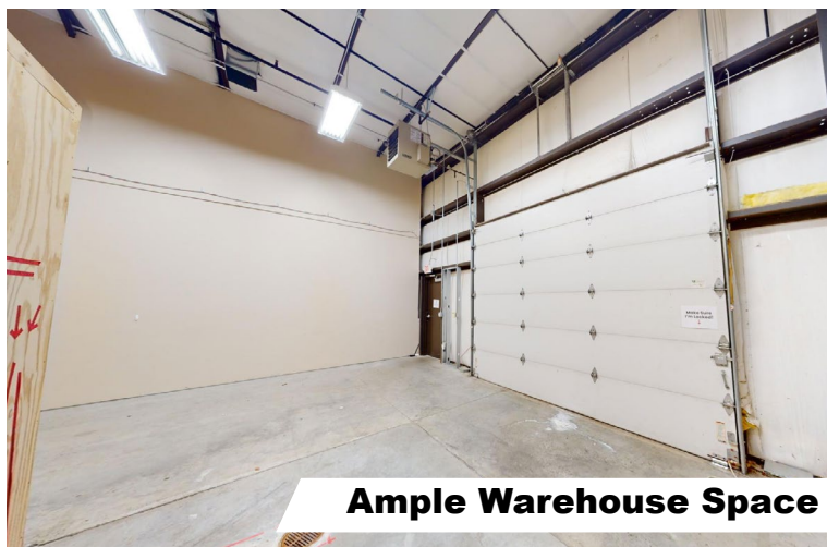
Ample Warehouse Space