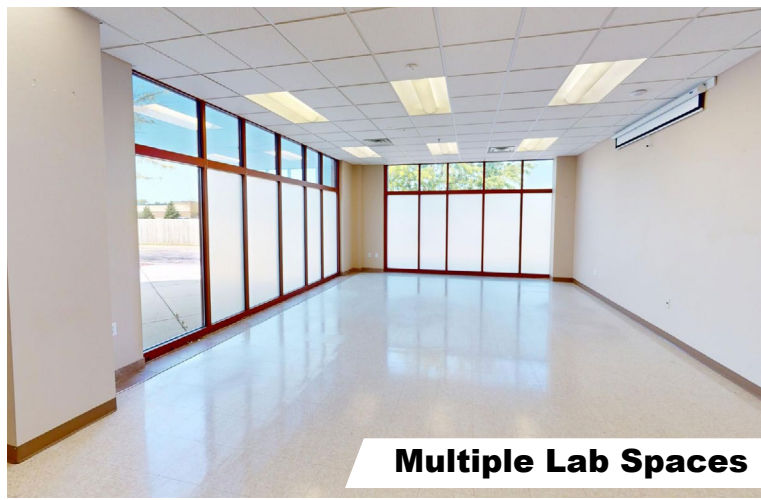
Multiple Lab Spaces