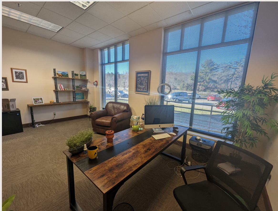
*Furniture not included in lease