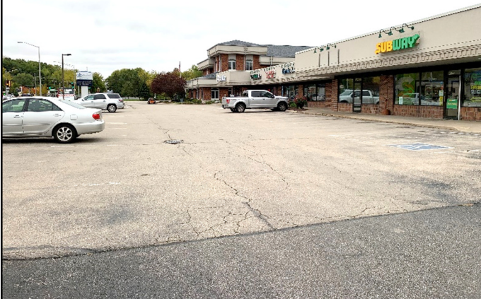
Back Parking Lot