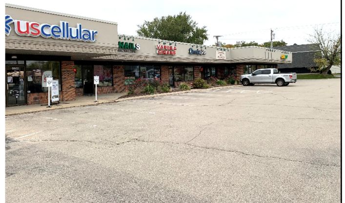
Back Parking Lot