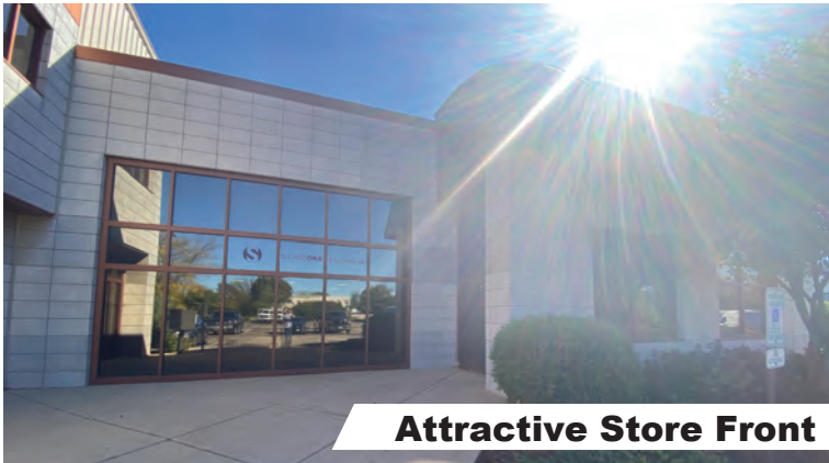
Attractive Store Front

2821 Dairy Dr. Suite 1, Madison, WI 53716