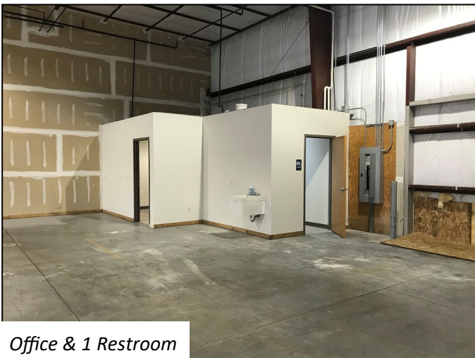
Office & 1 Restroom