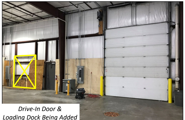
Drive-In Door & Loading Dock Being Added