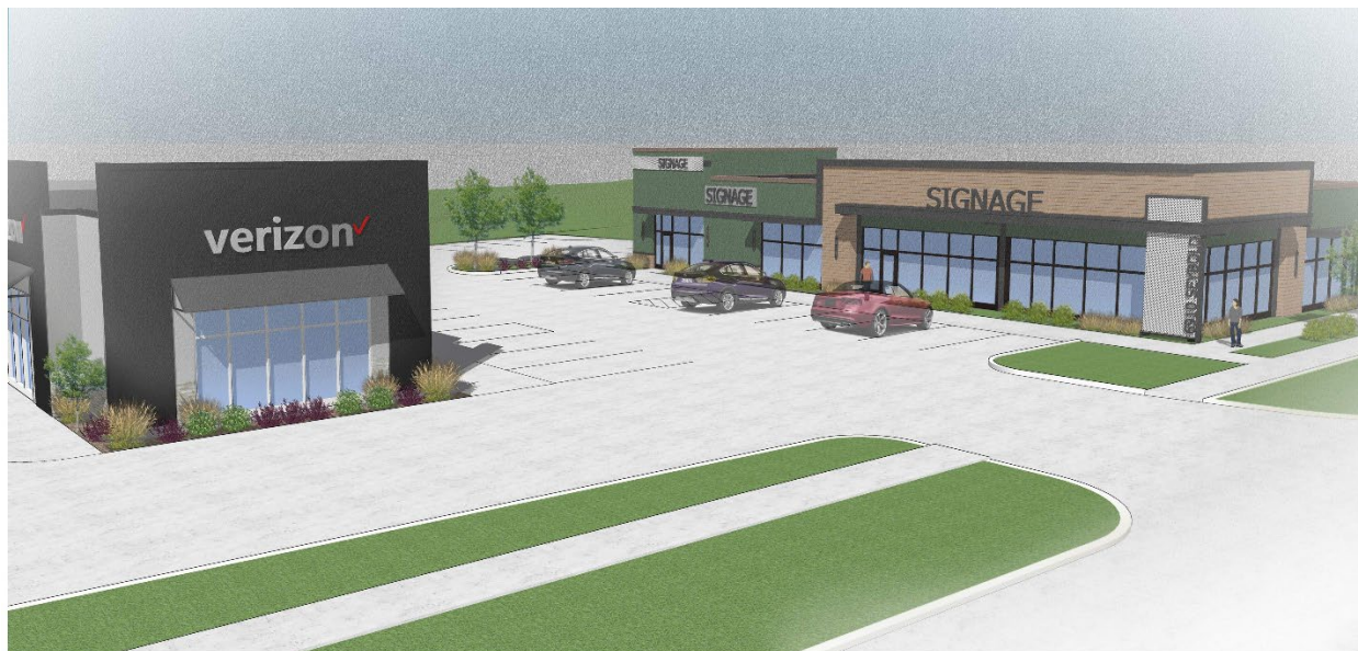
DIMENSION 6910 Seybold Road - Exterior Perspective