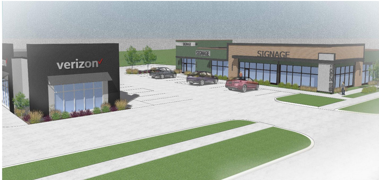
DIMENSION 6910 Seybold Road - Exterior Perspective Architecture - Interior Design - Group 5510 Westpark Drive, Suite 100, Madison, WI 53719 (608) 441-4444 • (608) 557-8299 • www.dimension.com