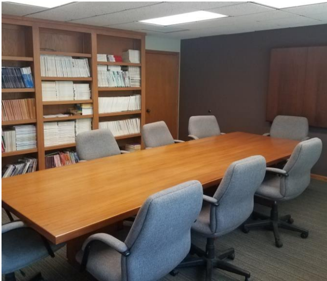
Conference room & lobby