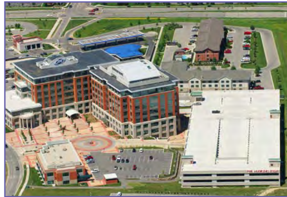
Parking Options / Surface and Ramp