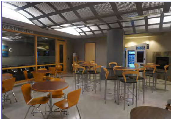
Access to Cafe at 525 Junction Rd.