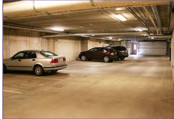
On-Site Secured Heated Underground Parking