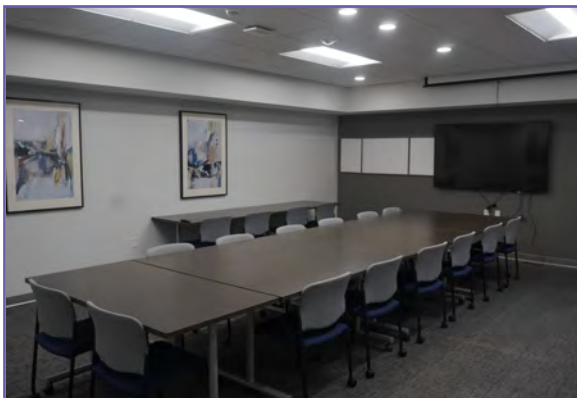
On-Site Board Room