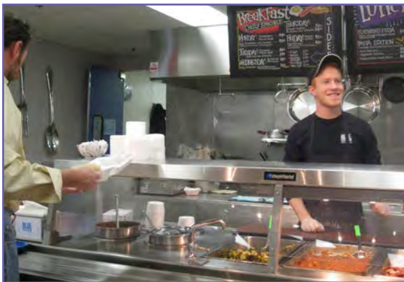
Full Service Cafe at 8401 Greenway