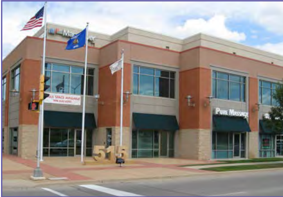
Building Signage Opportunities (1st Floor Only)