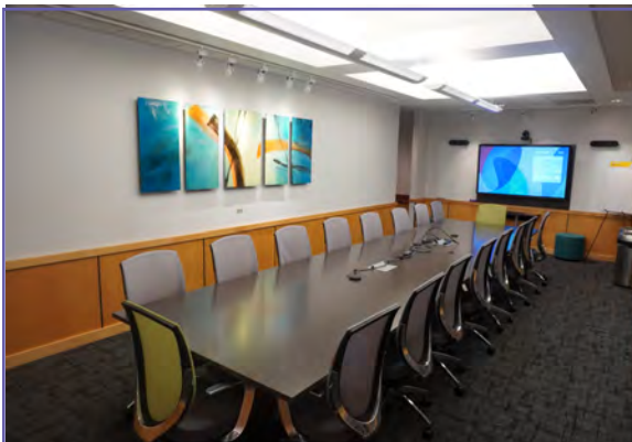
Access to Board Room at 525 Junction Rd.