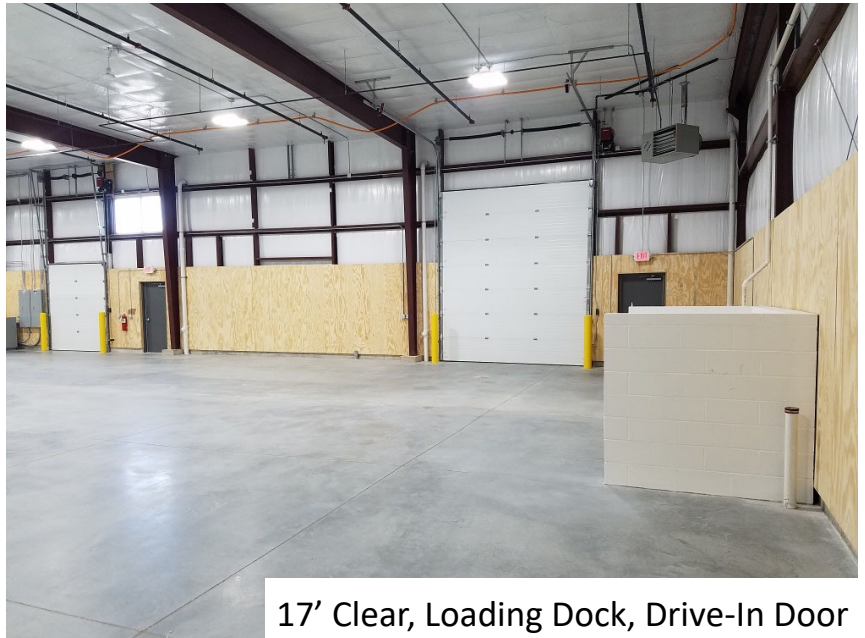
17' Clear, Loading Dock, Drive-In Door