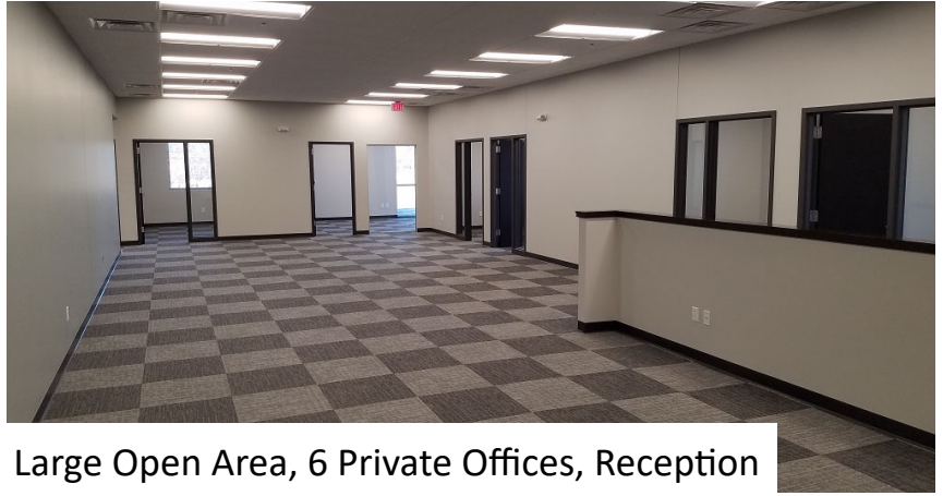
Large Open Area, 6 Private Offices, Reception