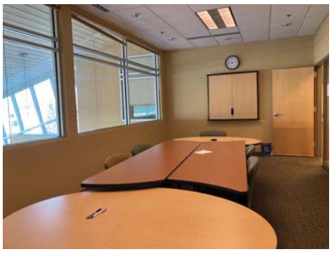
One of Many Conference Rooms