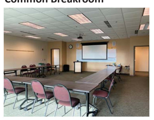
One of Many Conference Rooms