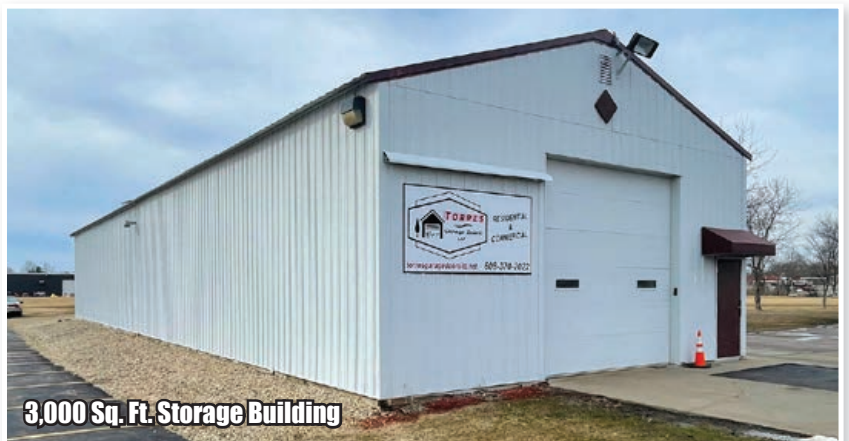
3,000 Sq. Ft. Storage Building