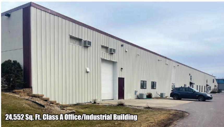
24,552 Sq. Ft. Class A Office/Industrial Building