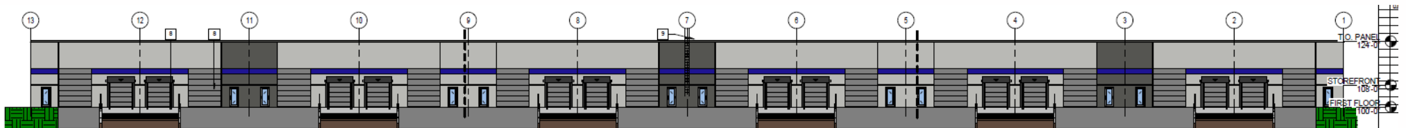
4 NORTH ELEVATION OVERALL VIEW