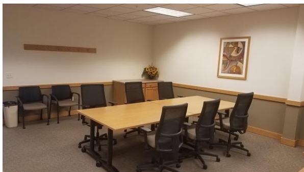
Shared Conference Room

This suite is close to the main lobby & has front & back entrances.