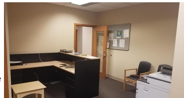
Reception of Available Suite

Information contained here comes from reliable sources, but accuracy is not guaranteed. Interested parties should independently verify all data.