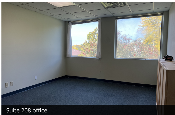
Suite 208 office