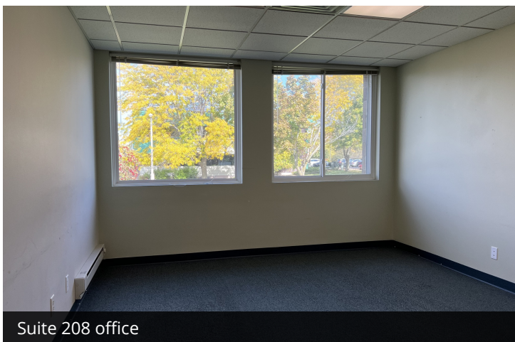
Suite 208 office