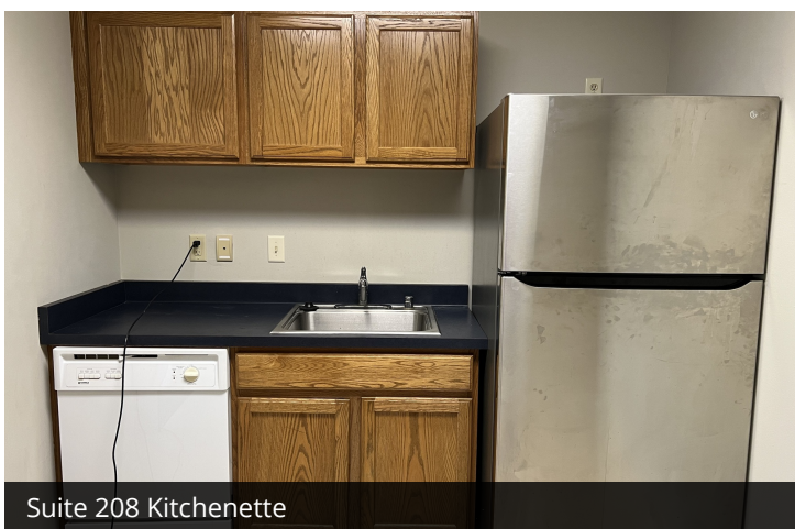
Suite 208 Kitchenette