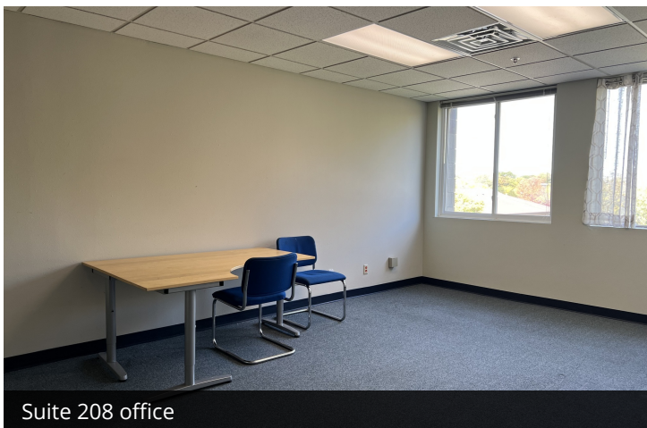
Suite 208 office