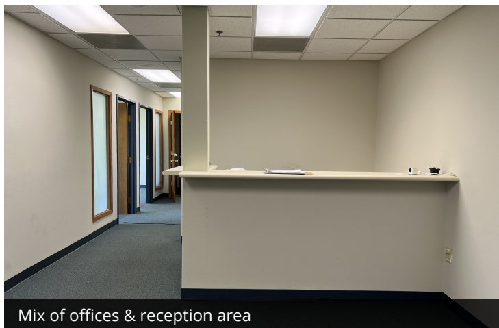
Mix of offices & reception area