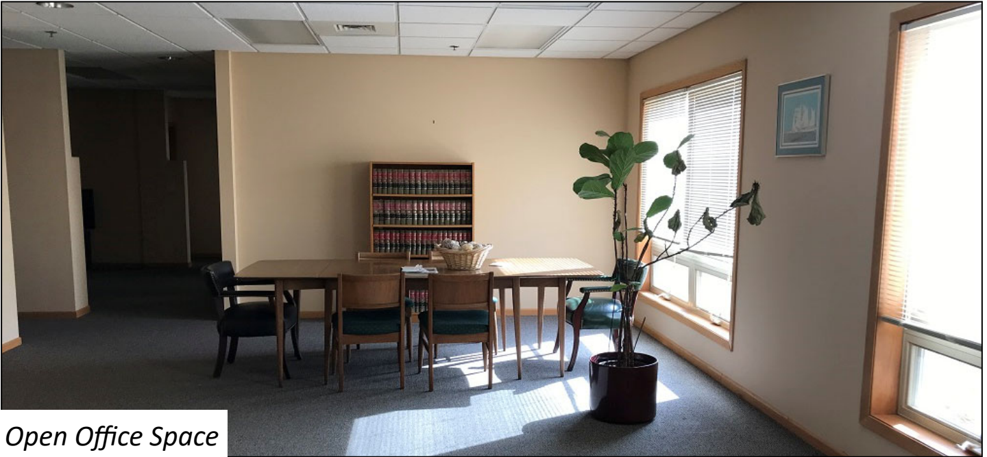
Open Office Space