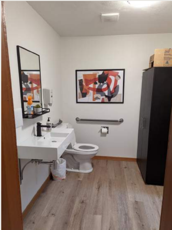
Common restroom with shower