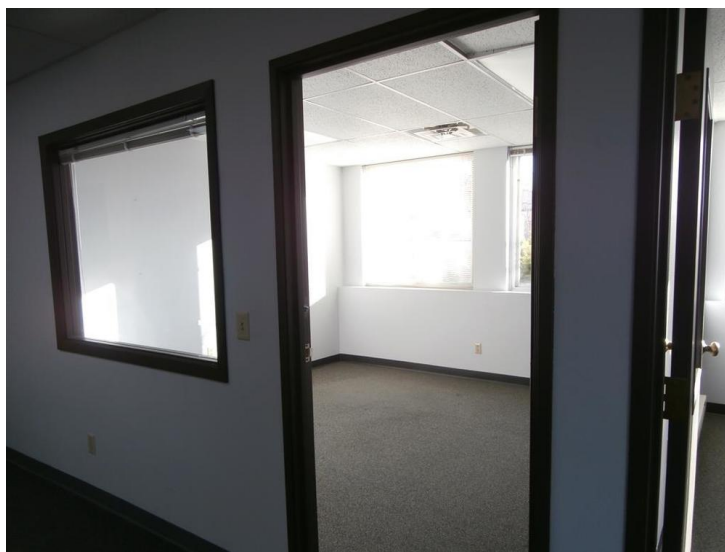
Private office example