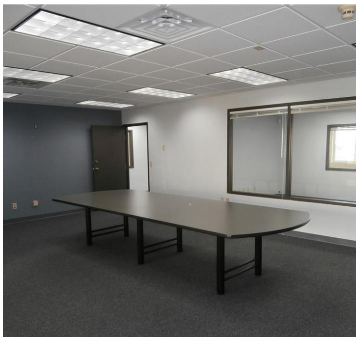
Large conference room