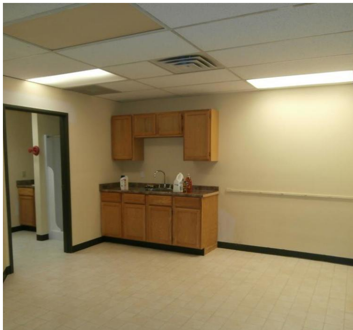
Break room and in-suite shower room