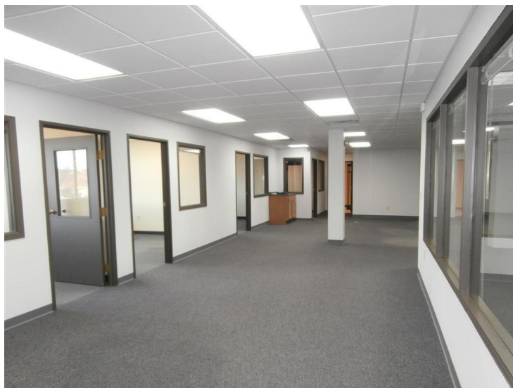
Mix of offices & open area