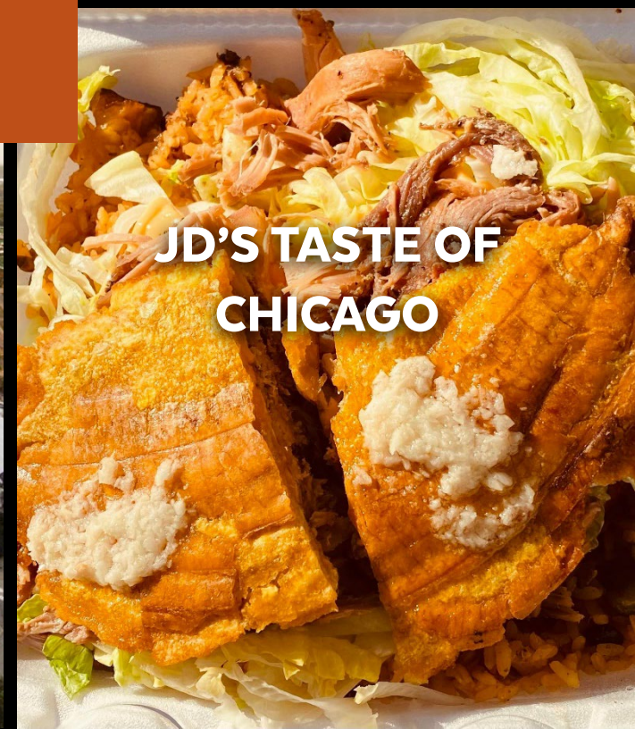
JD'S TASTE OF CHICAGO