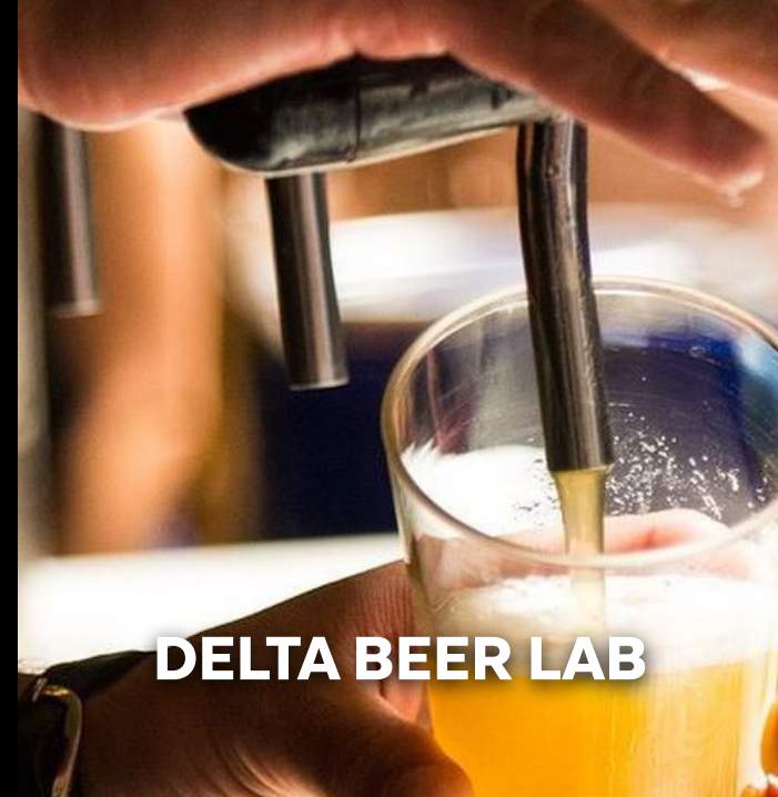
DELTA BEER LAB