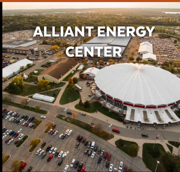
ALLIANT ENERGY CENTER