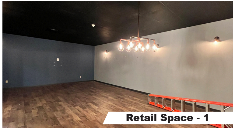
Retail Space - 1