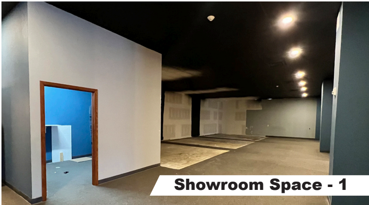
Showroom Space - 2