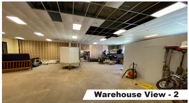
Warehouse View - 2