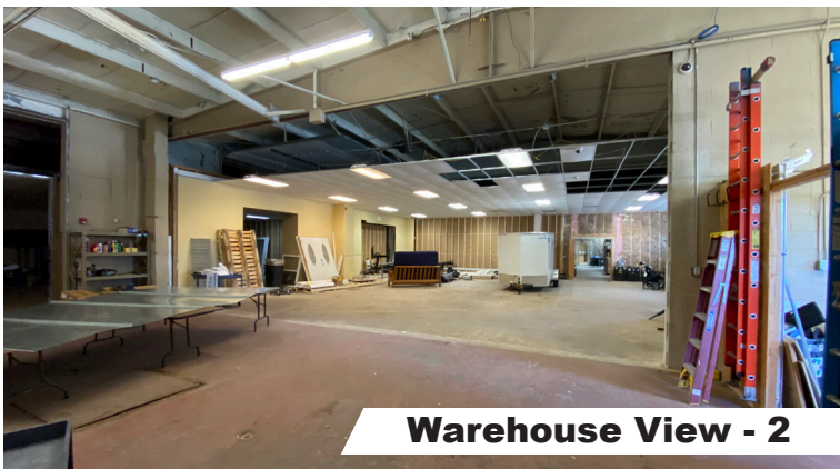
Warehouse View - 2