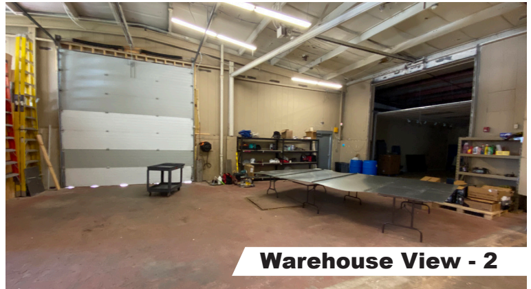
Warehouse View - 2