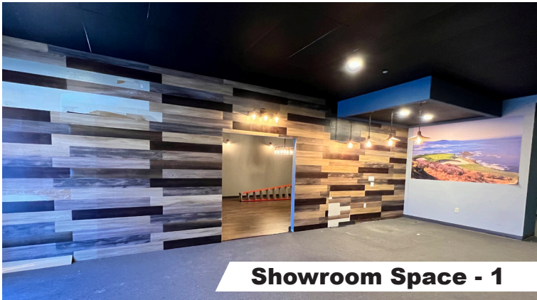
Showroom Space - 1

2425 S. Stoughton Road, Madison, WI 53716