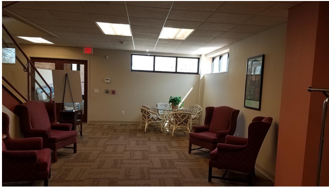
Common Entry Lobby + Classrooms