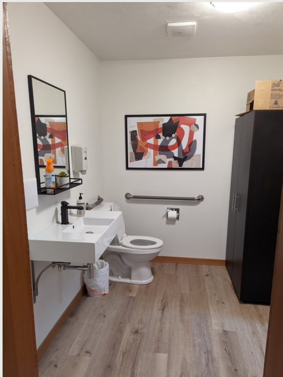
Common restroom with shower