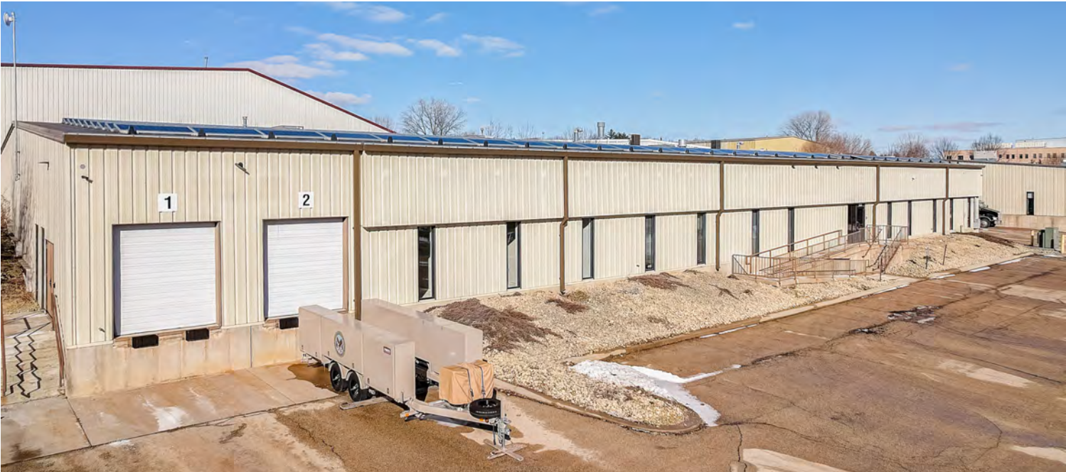
Private front entrance – separate identity