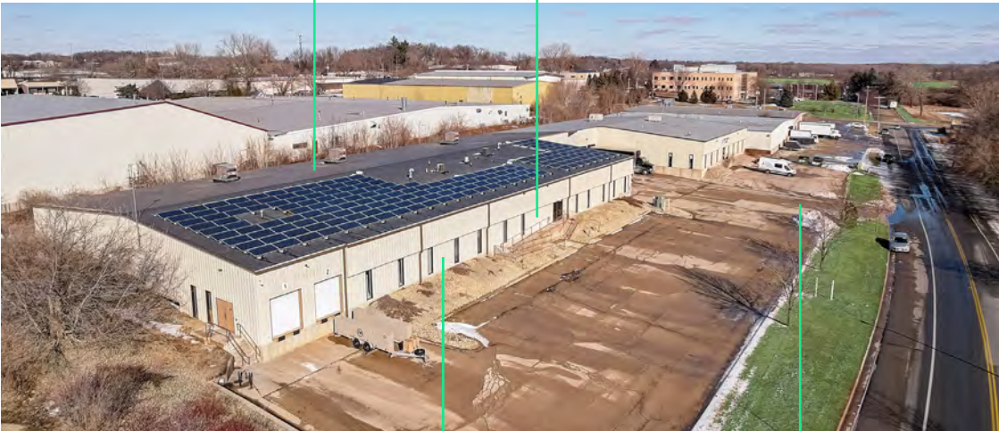
Solar panels installed 2017 - significant energy savings