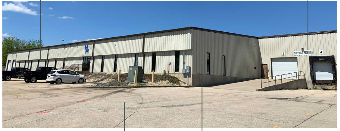
Private front entrance – separate identity

Roof insulation added in 2017, along with new rubber membrane