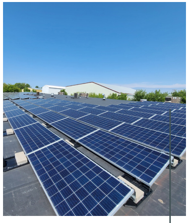
Solar panels installed 2017 - significant energy savings

Full length windows across front of building to allow natural light into office and warehouse