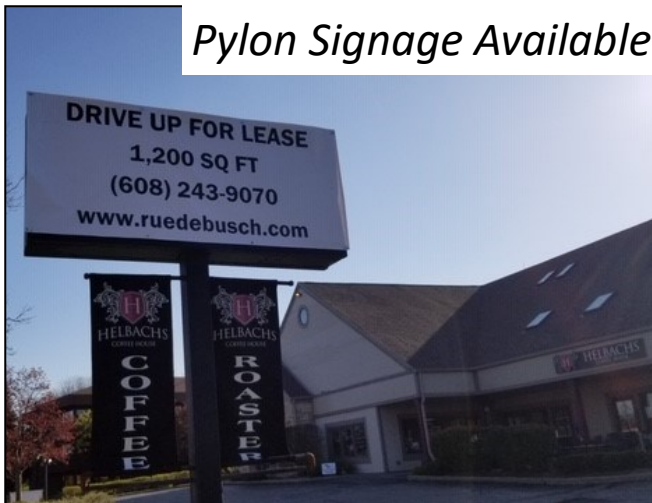
Pylon Signage Available