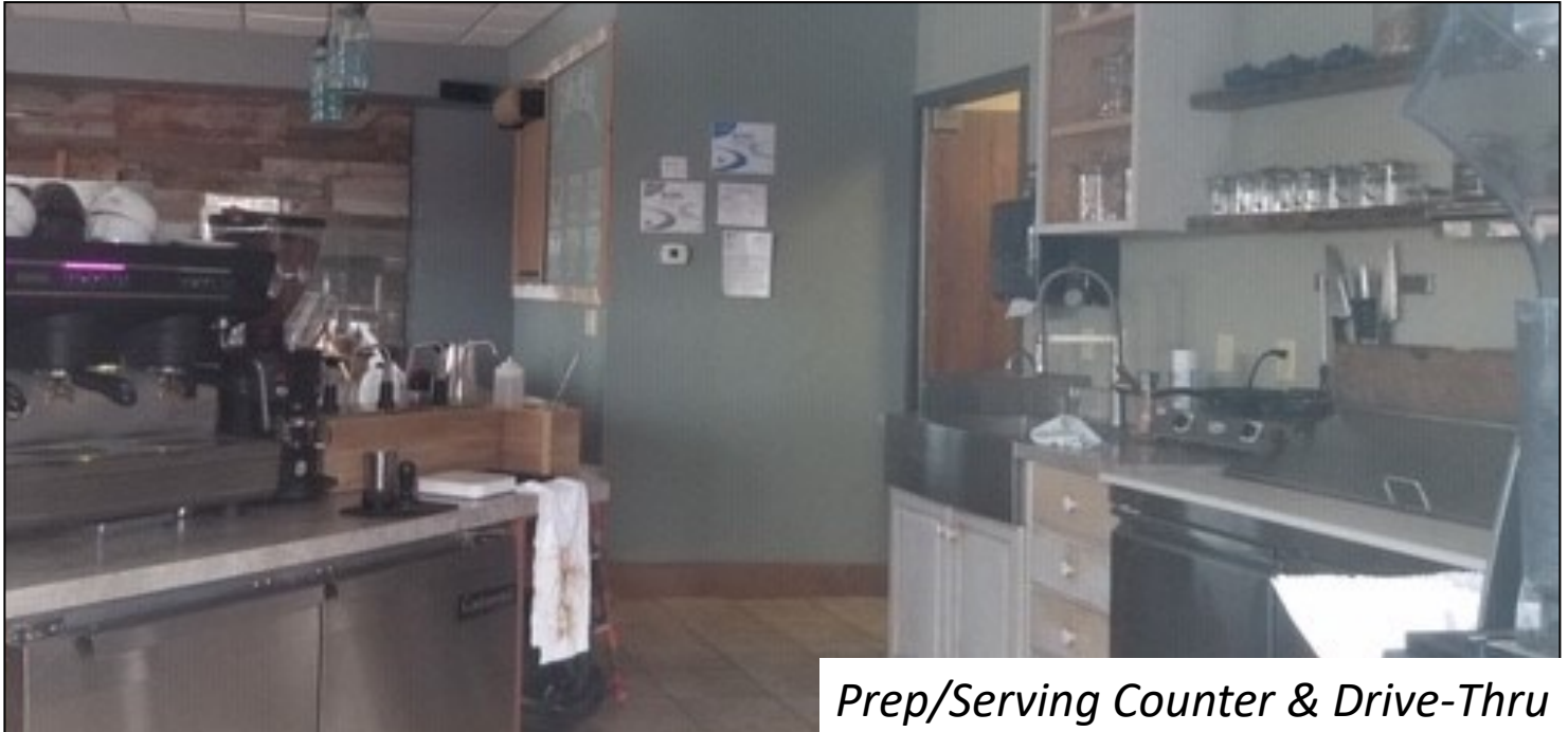
Prep/Serving Counter & Drive-Thru