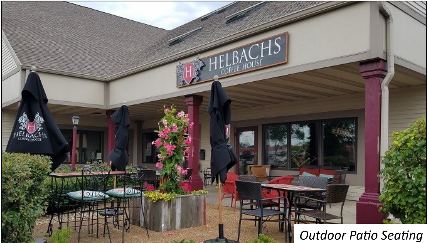
Outdoor Patio Seating