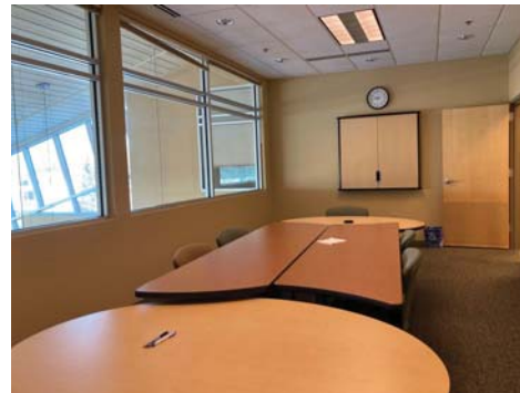
One of Many Conference Rooms