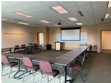
One of Many Conference Rooms