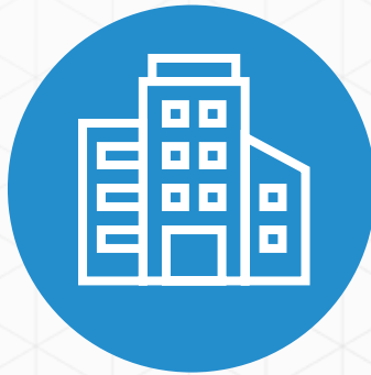
CLASS A OFFICE With A Variety Of Tenant Amenities