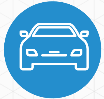
UNDERGROUND Parking Available