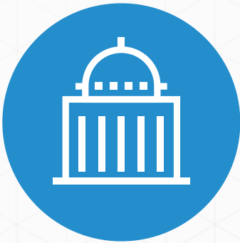
DOWNTOWN Location With Views Of The Capitol

Situated on West Washington Avenue in Downtown Madison, 316 West Washington is unmistakable, with its grand entranceway and double tower design. The powerful exterior molds into a highly functional tenant experience, with an abundance of space and views of the Capitol. This space provides some of the best amenities in the city, with on-site parking, bicycle storage, workout facilities, tenant conference rooms and easy access to some of the best bars and restaurants in Madison. 316 West Washington is home to established tech companies and startups alike, offering opportunity for users of all sizes.