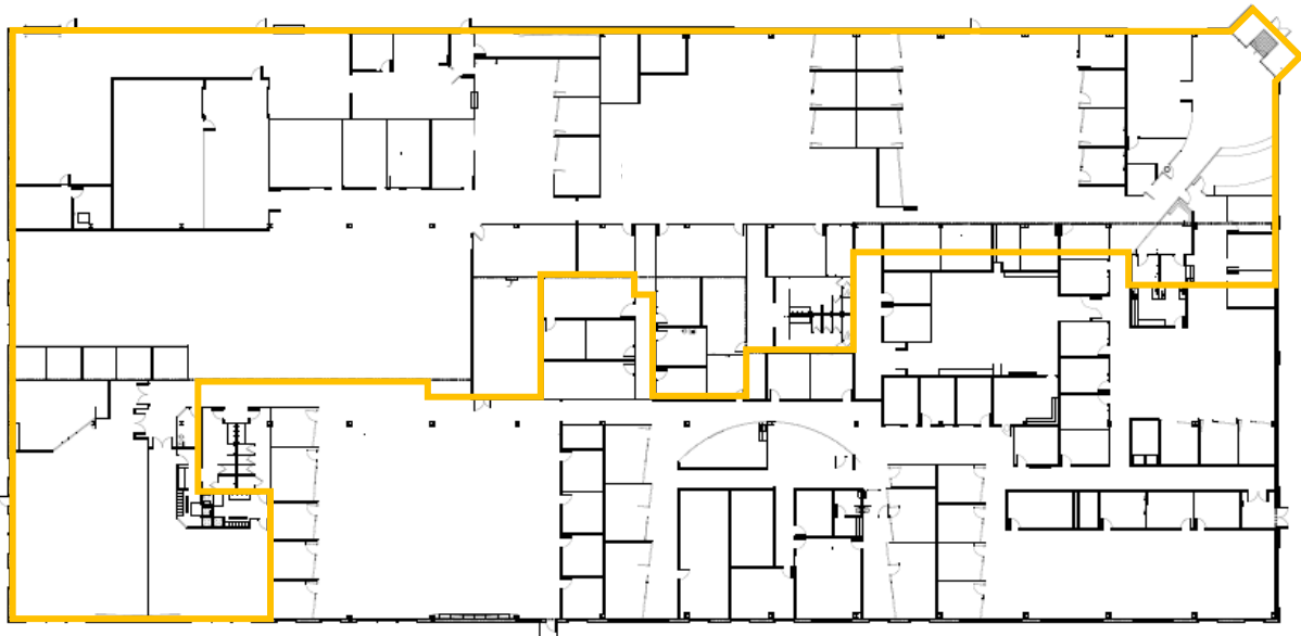
Existing Floor Plan Approximate Outline of Available Space