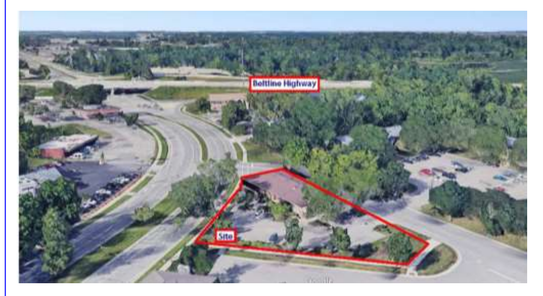
Location near W. Beltline & Whitney Way Intersection

Lease Term: 1 to 5 years – Security Deposit = 1 month's rent